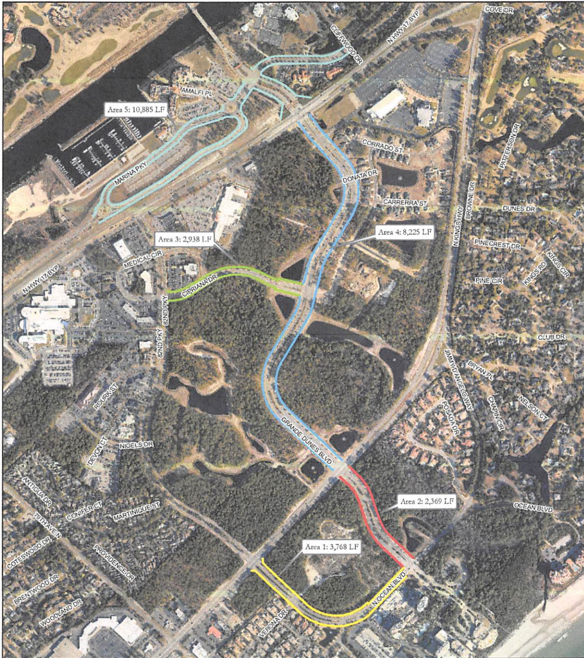
EXHIBIT B – SITE