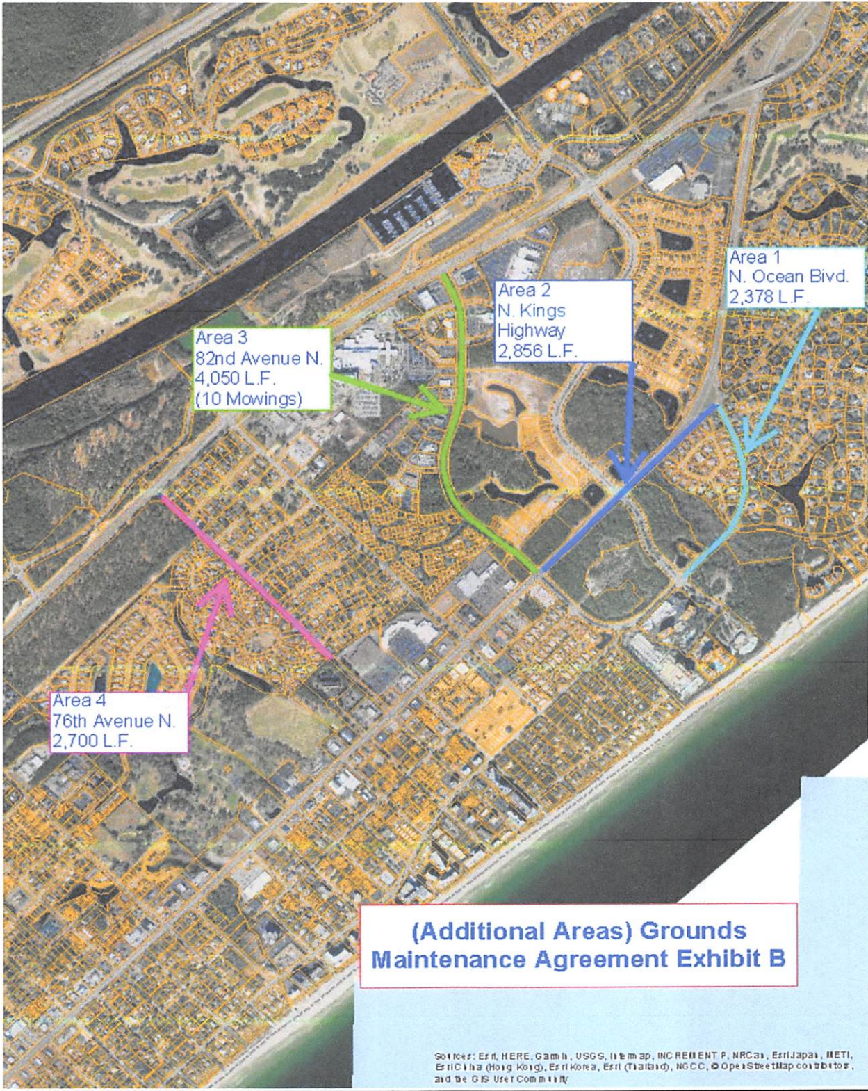
EXHIBIT B - SITE